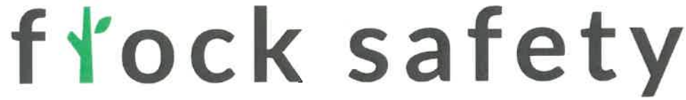
EXHIBIT A ORDER FORM